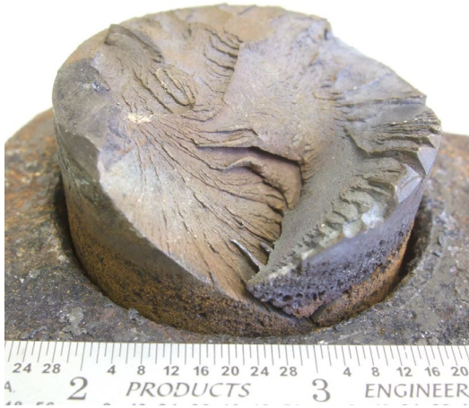
Figure 3: Surface corrosion and contamination are evident on the fracture surface of the failed turntable pin. Severe corrosion pits and surface cracks are also visible on the sidewall, which could have provided an indicator of the pin's unsafe condition prior to failure.

The Coast Guard strongly recommends that vessel owners and operators: