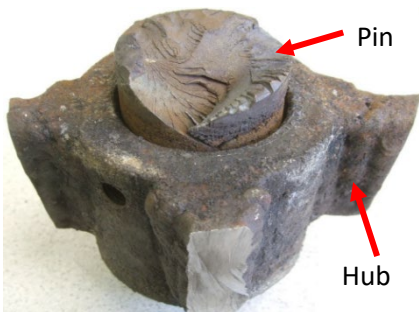
Figure 2: Accommodation ladder connection pin with severe corrosion over the pin's fracture surface & sidewall and on the surface of the hub.

After the incident, the Coast Guard noted that multiple foreign flag vessels had accommodation ladder turntable pins in service for more than 20 years without replacement. Guidelines on the maintenance of accommodation ladders is contained within 74 SOLAS (14) II-1/3-9, MSC.1/Circ. 1331, and 74 SOLAS (14) III/20.7.2; however, none of the aforementioned references include maintenance guidelines for the turntable pins.