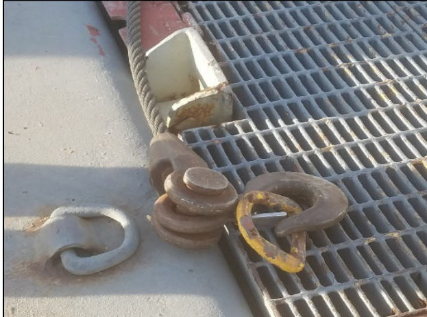
Figure 3. Separated D-Ring

for design and in-service testing of mooring fittings and cargo-handling cranes and associated gear, there are no prescriptive periodic testing or inspection requirements for general purpose D-rings or their securing straps. Consequently, similar failures may occur in the absence of an established inspection and maintenance program.