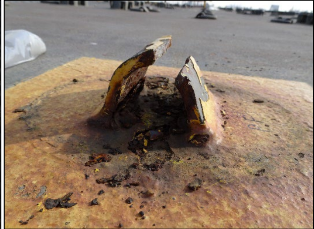
Figure 4. Failed Securing Strap

The Coast Guard strongly recommends that vessel owners, operators, and other maritime stakeholders: