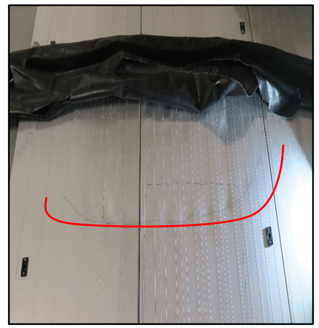
Figure 2 – Ruptured keel bladder and the view of the underside of the metal hull. The red line has been added to highlight the deformities in the hull metal due to the keel bladder rupture.

An investigation has identified that the keel bladder suffered a rupture due to excessive pressure in the tube. The recommended operating pressure by the manufacturer is 3.4 pounds per square inch (p.s.i) or 240 millibar pressure (mb). An on-scene survey of multiple inflatables on board the cruise ship noted pressures up to and exceeding 9 p.s.i. (620 mb) in other keel bladders. The keel bladder is not protected by a safety relief valve, and the manufacturer recommends that they be inflated with a foot pump to reduce the chance of overpressurization. However, crewmembers were routinely using an air compressor to fill the buoyancy chambers (including the keel tube) prior to the incident. In addition, pressure levels were not being checked using a manometer as recommended by the manufacturer.